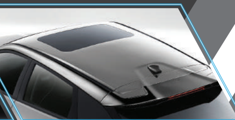
Electric Sunroof Link with Intelligent Voice Assistant