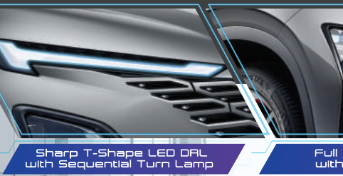
Sharp T-Shape LED DRL with Sequential Turn Lamp