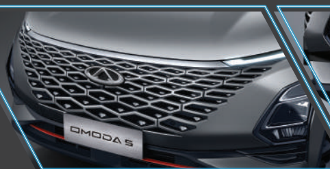
One-piece Star Diamond Front Grille

Omoda 5 menghadirkan mobil dengan tampilan modern dan futuristic yang akan membuat perjalanan Anda melampaui perjalanan waktu menuju masa depan.