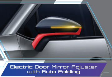
Electric Door Mirror Adjuster with Auto Folding