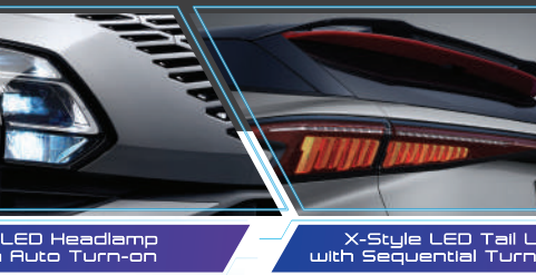
Full LED Headlamp with Auto Turn-on