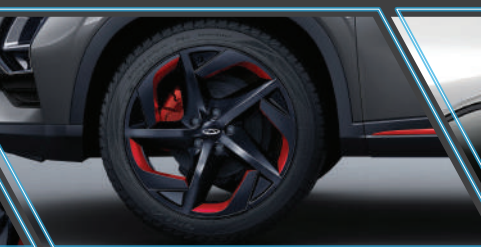
18" Star-Shape Sporty Wheel with Two Tone Color