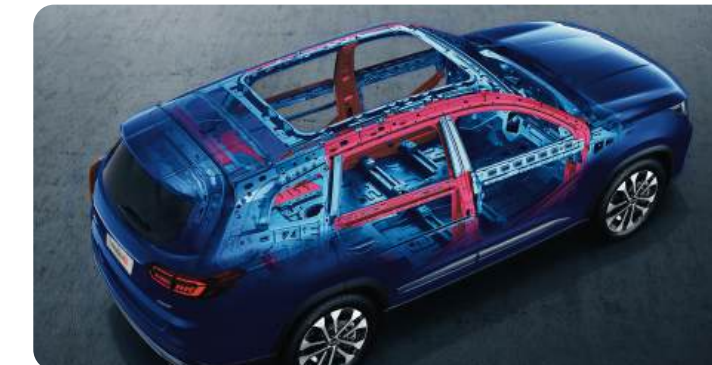
60%+ High Strength Steel Body