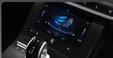
Center Console with Screen and Piano Black Material