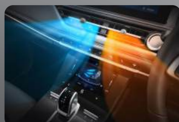
Dual Zone A/C with N95 Filter