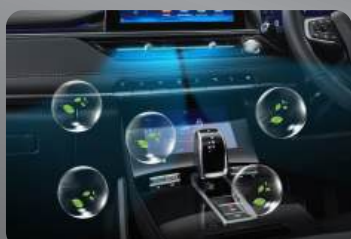
N95 Filter A/C