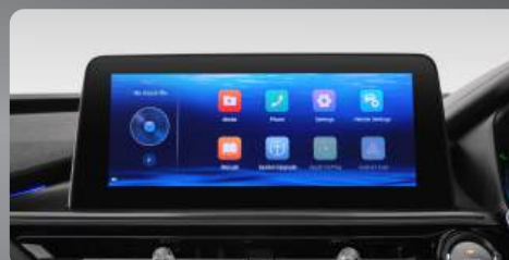
10.25 inch HD Display Head-unit