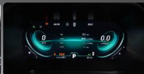
Sporty Meter Cluster