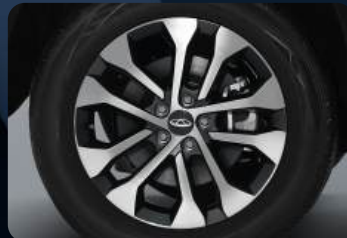
Velg 18 inch with Two-tone Finish