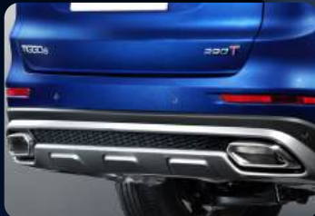
Dual Exhaust with Chrome Platted