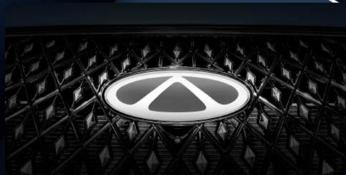
Illuminated Logo Lighted