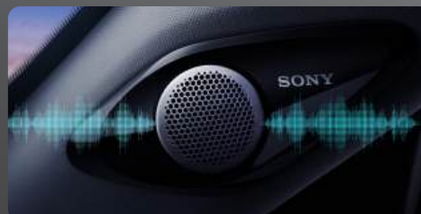
8 Sony Audio Speakers