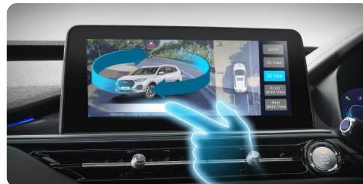
360° HD Panoramic Camera