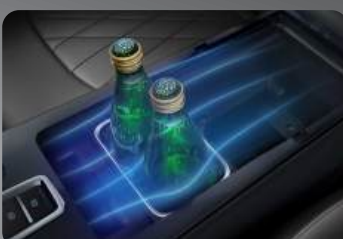
Armrest Box Refrigeration