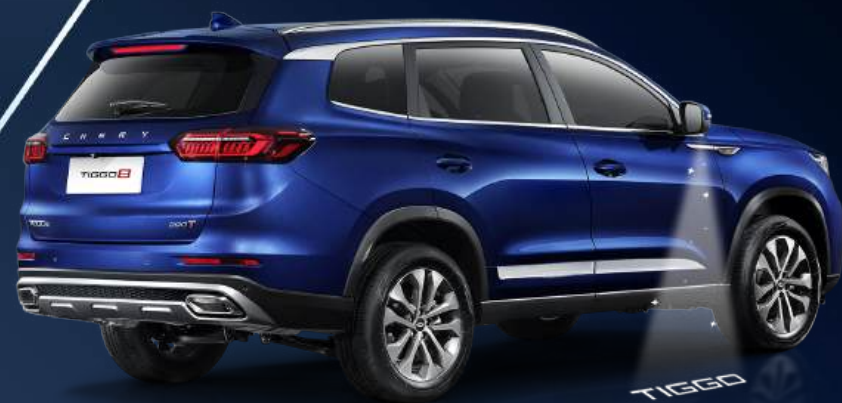
Tiggo Fashion Welcome Light