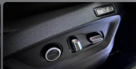
Electric Seat Control with Memory Adjustment