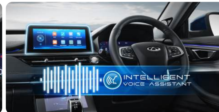
Intelligent Voice Assistant