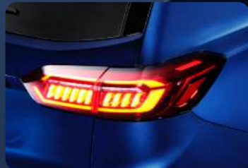
LED Rearlamp with Sequential Turn Signal