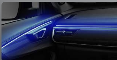
Multicolor Ambient Light