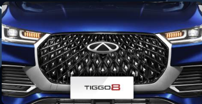
Galaxy Front Face with Matrix Diamonds Front Grille