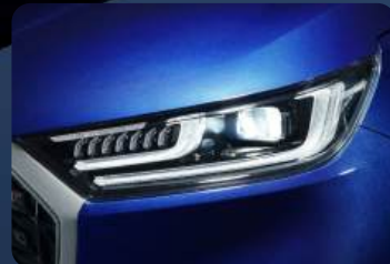
Full LED Headlamp with DRL Light System