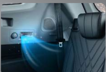
3rd Row A/C